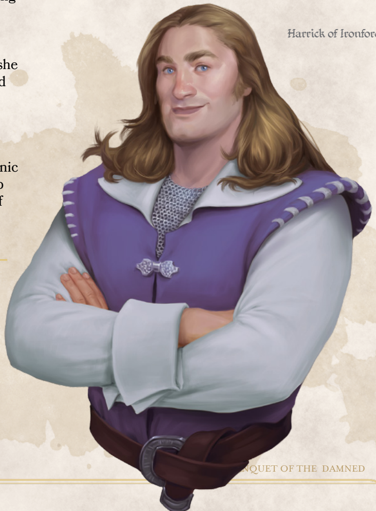
Harrick of Ironford

Demons of greed have the ability to infuse specially prepared food with their essence and gain limited control over anyone who eats it. Gulabuses gain the ability to communicate telepathically with an affected creature, make it hallucinate, and cause lethal maggots to appear in its stomach. They typically use these abilities